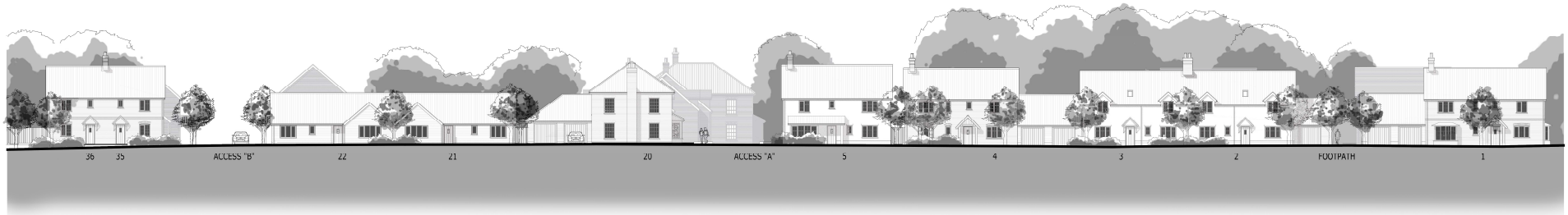
Proposed Streetscene along Lodge Road